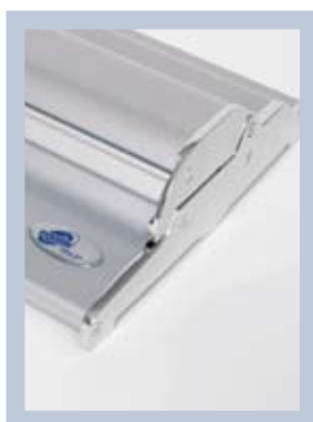
Roll Up Professional has a more exclusive design, for example with concealed screw heads.